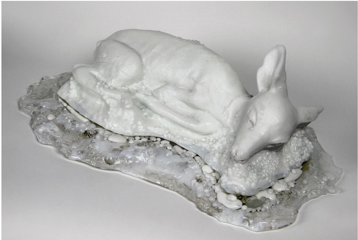
RISING FAWN I , 2020, kiln cast glass, 8 x 24 x 13 in.

SIBYLLE PERETTI | Backwater April 3 – May 16, 2020 Reception for the artist: Thursday, April 2, 6-8pm